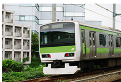
JR Yamanote Line