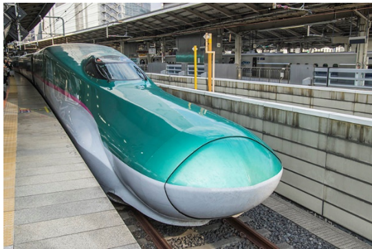
Bullet Train (Shinkansen)