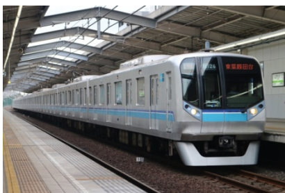
Tokyo Metro Subway