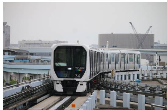
New Transit Waterfront Line (Yurikamome)