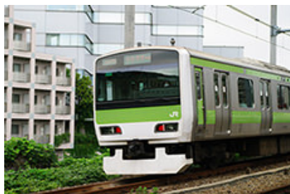
JR Yamanote Line